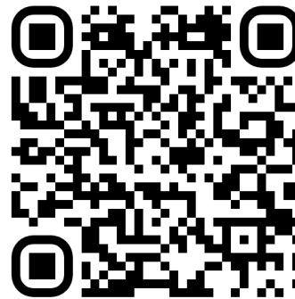
Rotherham Local Offer