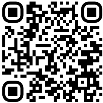
CBeebies Parenting Helpline